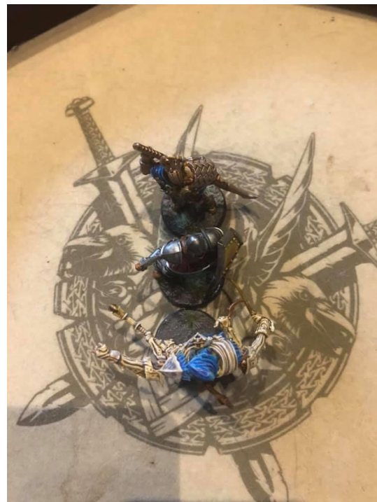
Figure i- this 100k soldier is being flanked

Injuries and On The Edge are treated in the same way as they are with Volley.